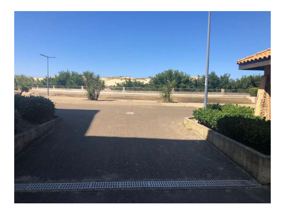
Then, downstairs, turn left to go around the "Trinquart" building.